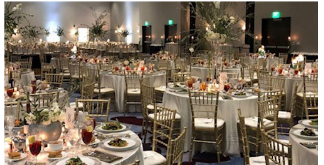
Left: Amarillo Belles & Beaux . Top Right: Bottom right: Symphony Ball: A Southern Affair