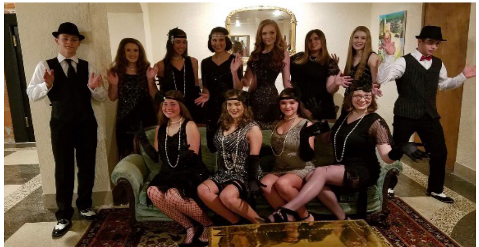
San Angelo's Year in Review

Our mission to protect and increase the public investment in the arts is alive and well and as we work through the 86th Texas Legislative Session we have much to share. At the advocacy update, Texans for the Arts will give a report about the current state of affairs with local, state and national public funding - the Municipal Hotel Occupancy Tax, the Texas Commission on the Arts, and the National Endowment