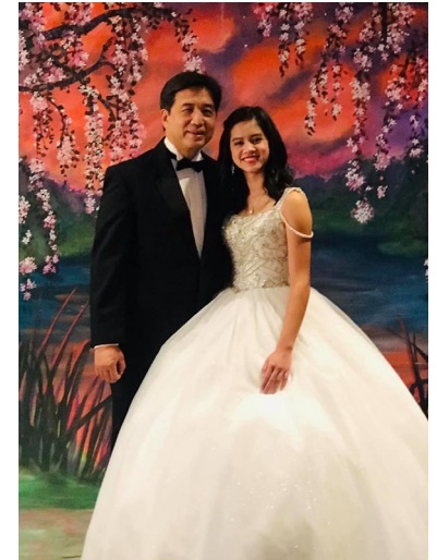
Beaux , Belles and their families from the "Journey to the East " Gala held August 1st.

Earlier in the spring baskets were delivered to our graduating High school guild ambassador seniors and each board member wrote a note to each of them as we tried to be a significant part of our community's efforts to honor the seniors that were so sadly robbed of most if not all of their spring events.