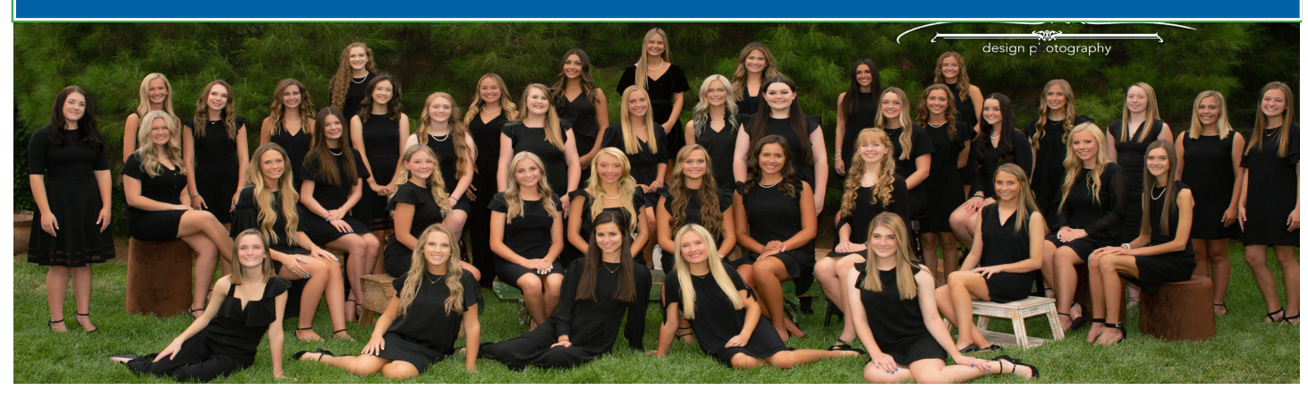
Lubbock Symphony Guild Symphony Debutantes