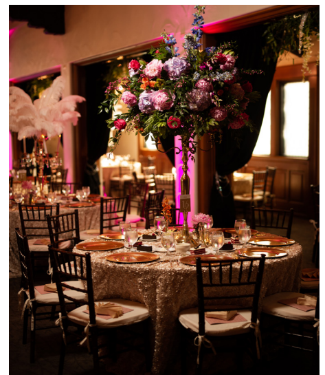
Top: Belles and Beaus, Middle: 2021 Symphony Ball Committee. Bottom: A Gatsby Affair