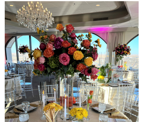
Top: 2021-2022 Symphony Belles and Beaux . Bottom: 67th Annual Symphony Ball.

downtown. The breathtaking rose-wrapped spiral staircase was a masterpiece, especially when the time came to present our 2021-2022 Symphony Belles and Beaux! Financial reports are still being finalized, but we expect to make a sizeable gift to our Symphony's education programs soon! The Guild will hold a membership drive in May. We aim to recruit new members, facilitate membership renewals, and reconnect with our lifetime members. Guild representatives will be present on both evenings of the ASO's May concerts to assist with this process and to share information.