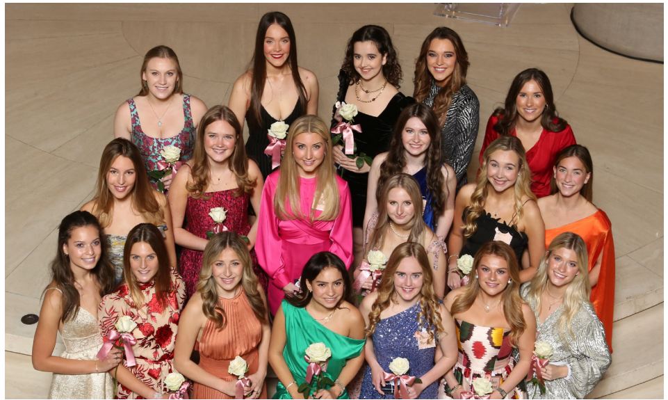
2023 DSOL Debutantes at the Meyerson Symphony Center.