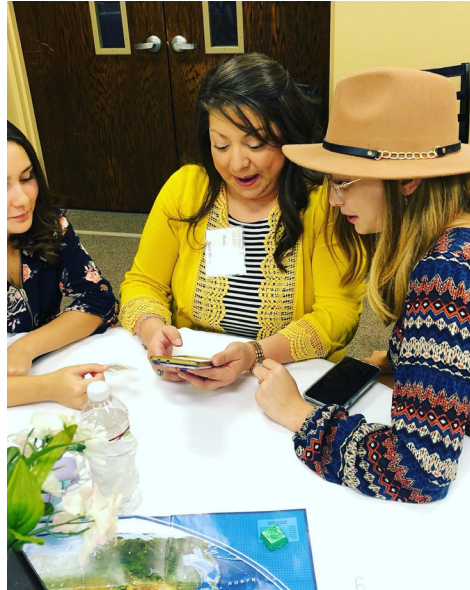
San Angelo Tech class.