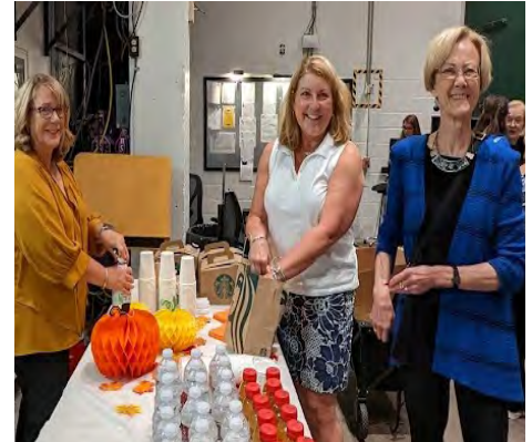
Houston Symphony League Breakfast volunteers.