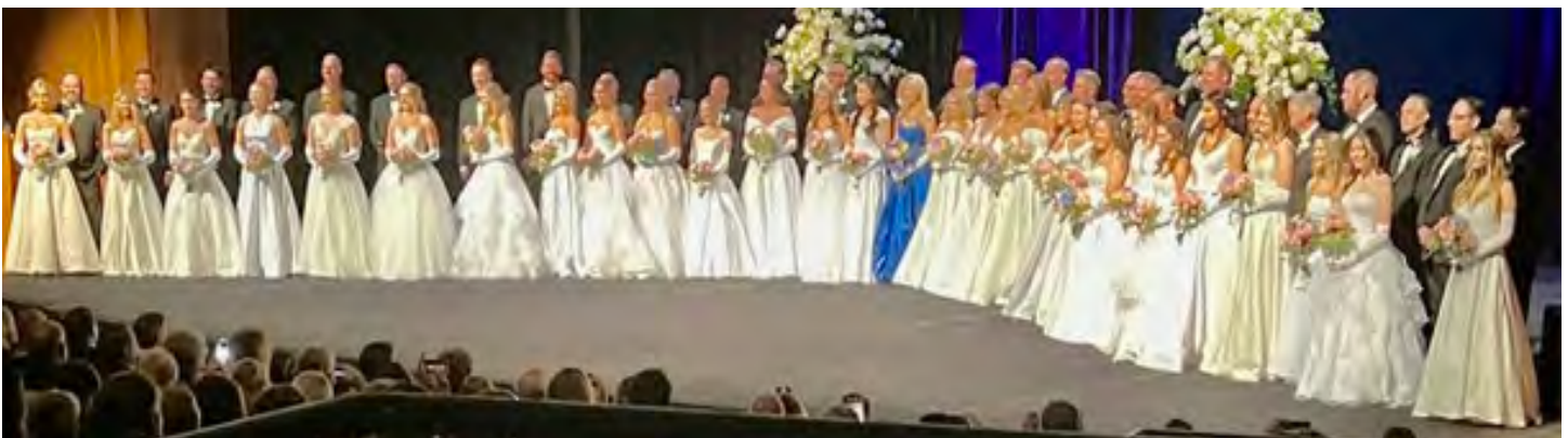
The Lubbock Symphony Guild Debutantes

The Guild will hold a membership drive in May. We aim to recruit new members, facilitate membership renewals, and reconnect with our members. Guild representatives will be present at the rest of the LSO concerts and end the season with the music of Queen.