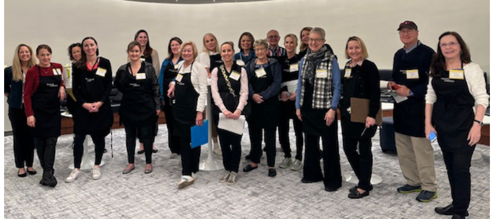
Student and Family Concert Volunteers.